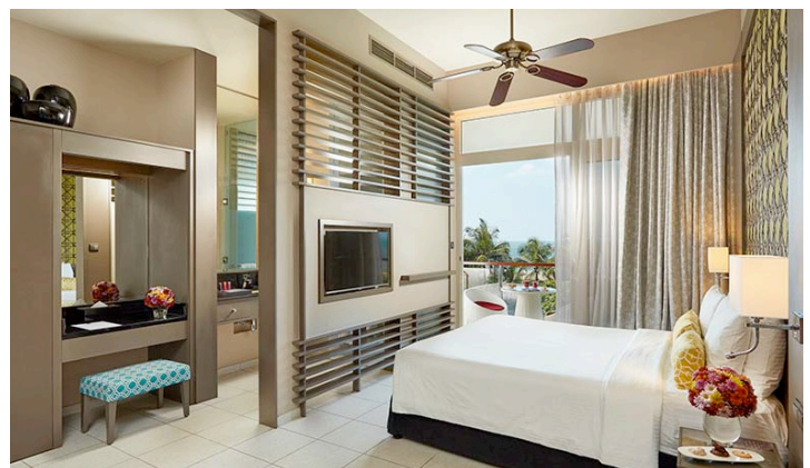
Superior Deluxe Room